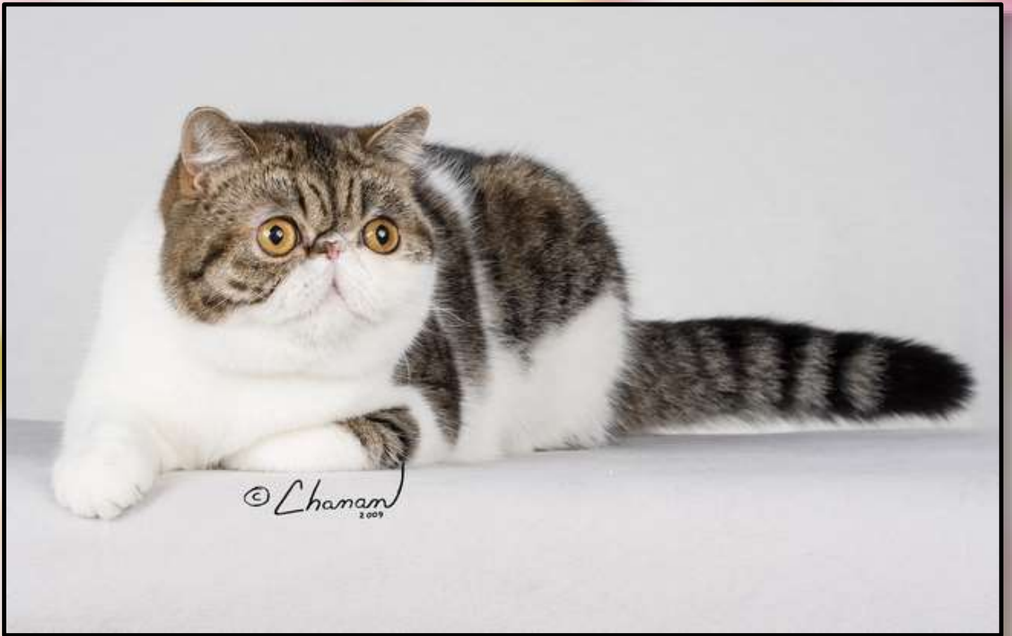
GC, NW D'EDEN LOVER LOLLIPOP OF WISHES Brown spotted tabby & white Exotic - 2 nd Best Kitten 2006-2007