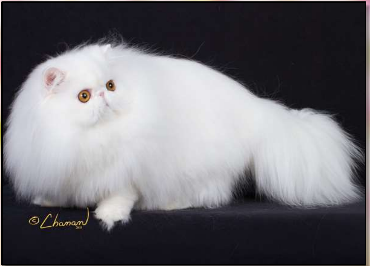
GC, NW CINEMA'S LIBERACE OF WISHES Copper-eyed white Persian - 12 th Best Kitten, 14 th Best Cat in Premiership – 2014-2015