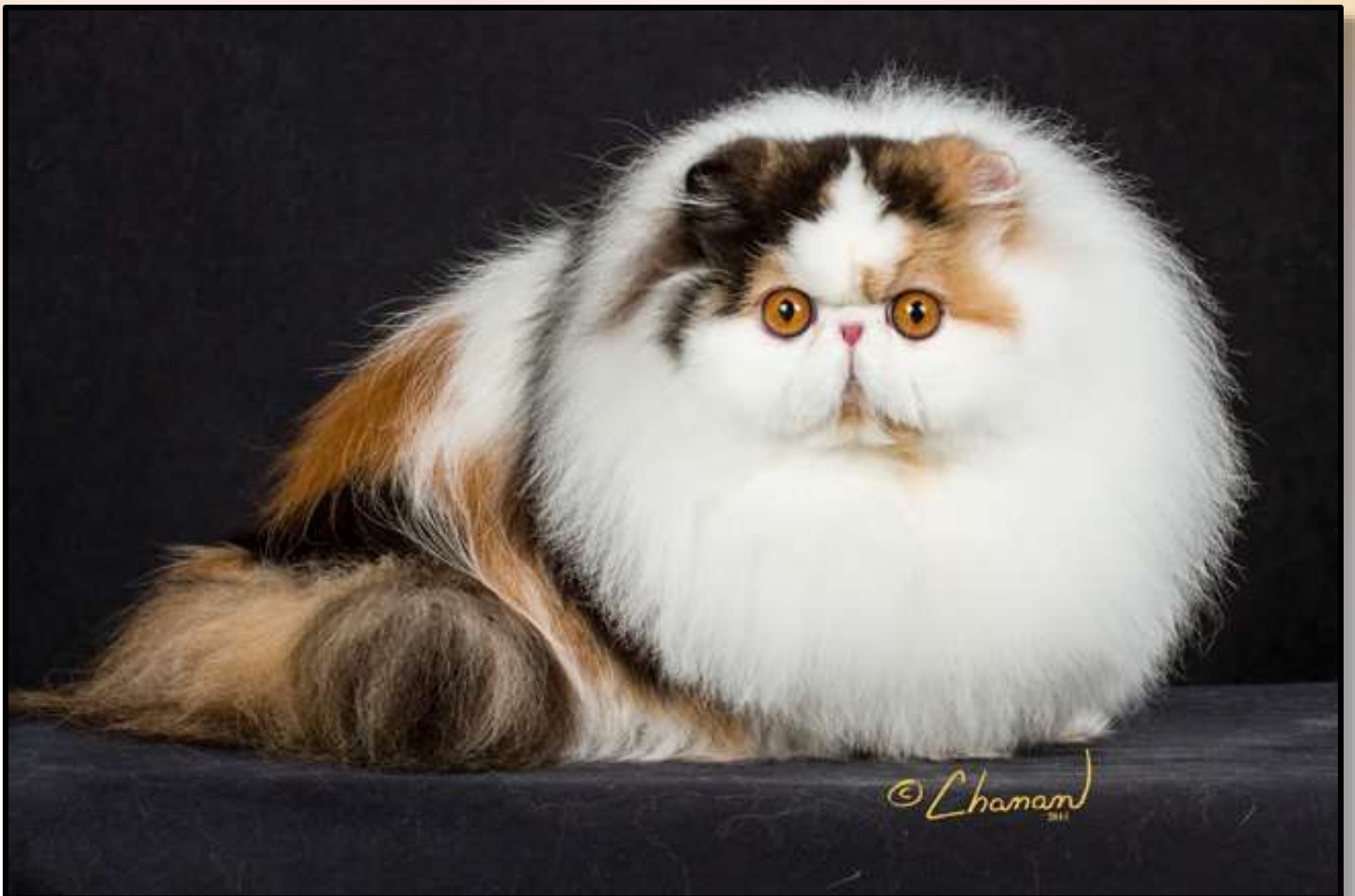
GC, BW, NW BELAMY'S DESIDERATA OF CINEMA Calico Persian - Best Cat 2013-2014