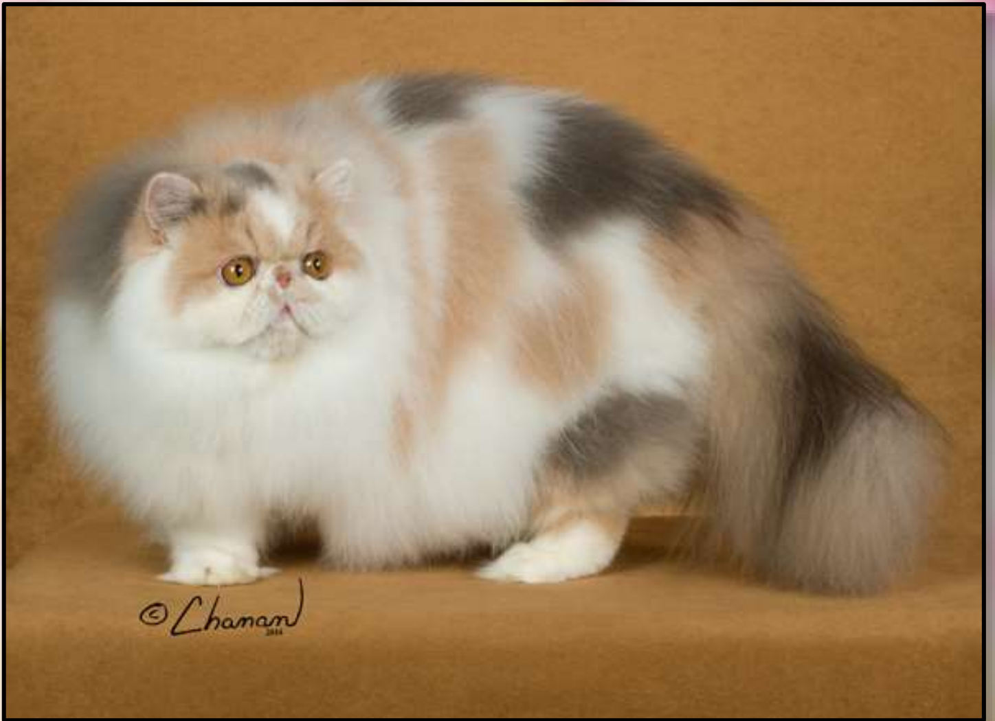
GC, BW, NW BELAMY'S ODETTA OF CINEMA Dilute calico Persian - 2 nd Best Cat 2014-2015